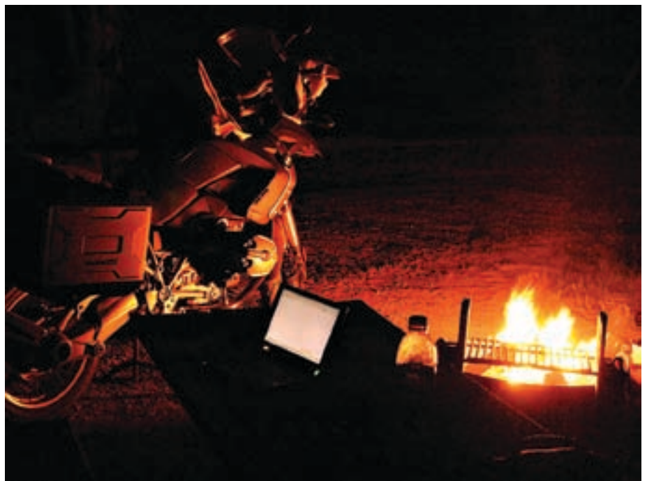
The author rarely travels without his laptop.