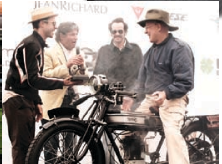
Actors Jason Lee and Giovanni Ribisi presenting the “Elvis” award at the Legend of the Motorcycle Show.