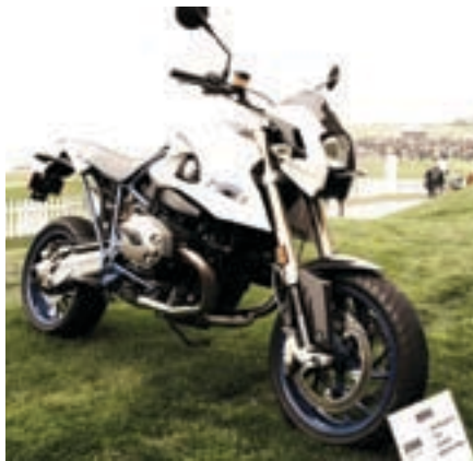
The BMWs were everywhere at the show.

Very little thought or planning is required to set out on an exploration ride in our modern “push button adventure” world. Gone for the most part is dependence on maps and compasses—just hit the power and ask the GPS. I’ve learned that while technology is amazing in